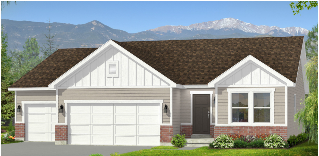
CRAFTSMAN (OPTIONAL 3 RD CAR GARAGE)

Equal Housing Opportunity. All home and community information, including but not limited to pricing, included features, terms, availability, and amenities, is subject to change at any time without prior notice or obligation. All renderings, photographs, colors, features, and dimensions are for illustrative purposes only. Square footage is approximate. For complete details, please consult a sales representative. [3/25/2026]