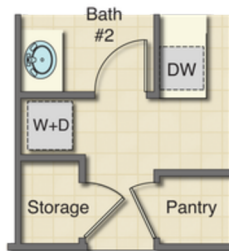
Basement Stacked Washer & Dryer