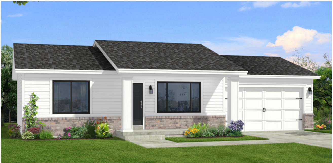
CRAFTSMAN: Exterior #7 with brick upgrade

Equal Housing Opportunity. All home and community information, including but not limited to pricing, included features, terms, availability, and amenities, is subject to change at any time without prior notice or obligation. All renderings, photographs, colors, features, and dimensions are for illustrative purposes only. Square footage is approximate. For complete details, please consult a sales representative. [3/25/2026]