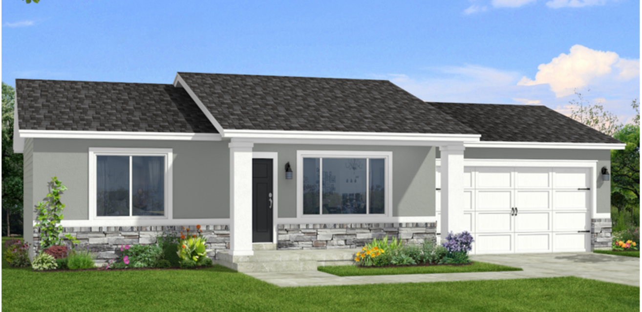
COTTAGE: Exterior #1 with stone upgrade

2 bed | 1 bath | 2-car 1920 Sq Ft • Garage 440 Sq Ft